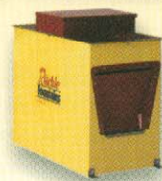
3 Combination 16769