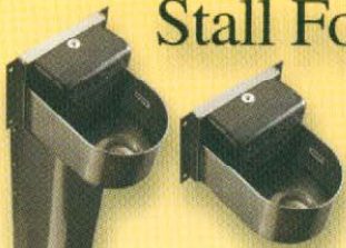
Stall Fount 125 heated 18082