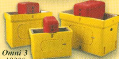
Omni 3 18270